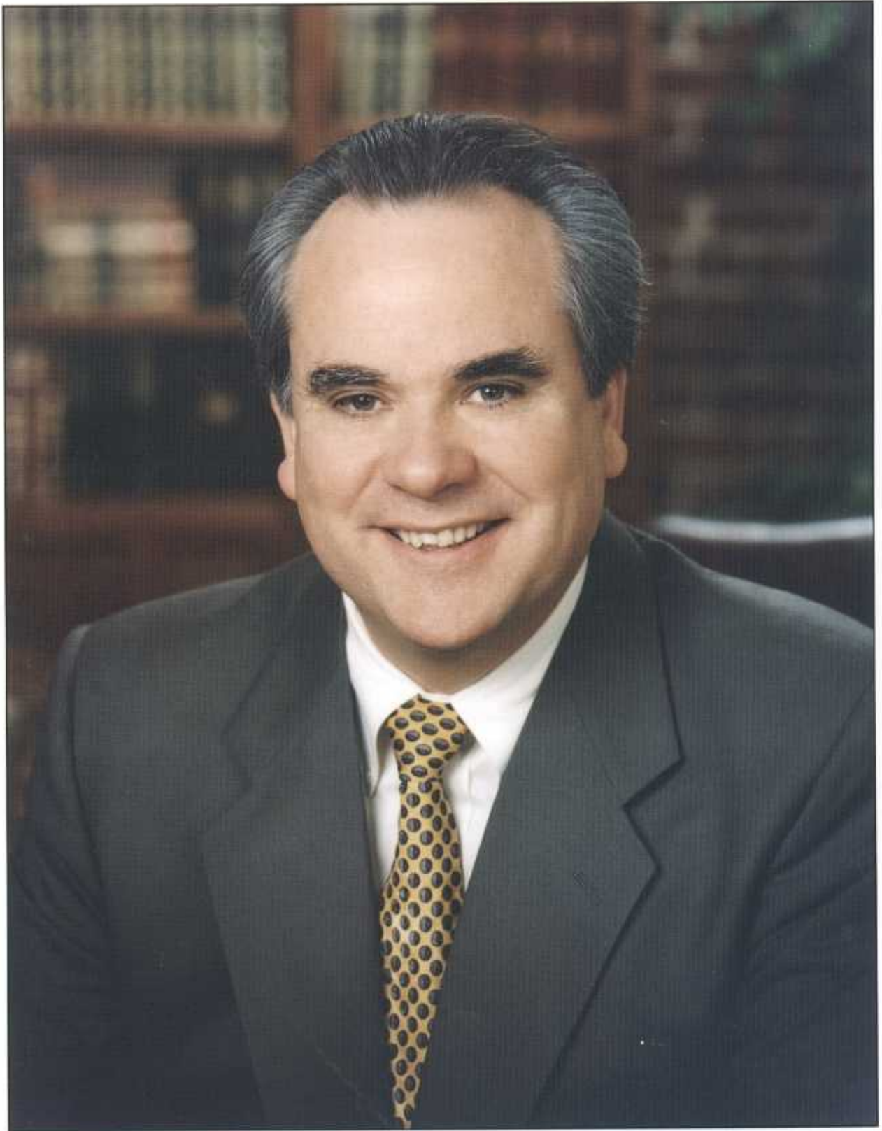
BILL LOCKYER Attorney General